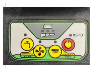
PRESET WORKING PROGRAMS