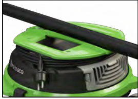
INTEGRATED CORD WRAP