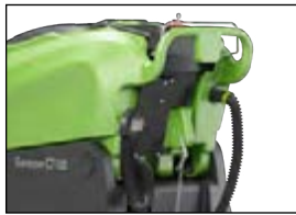
NEW ERGONOMIC HANDLE