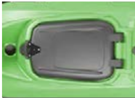
NEW LARGE COVER