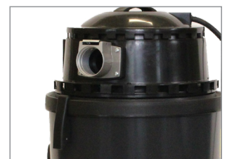
DUAL VACUUM AND BLOWER CAPABILITIES