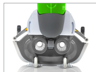
EASY STORAGE AND TRANSPORTATION